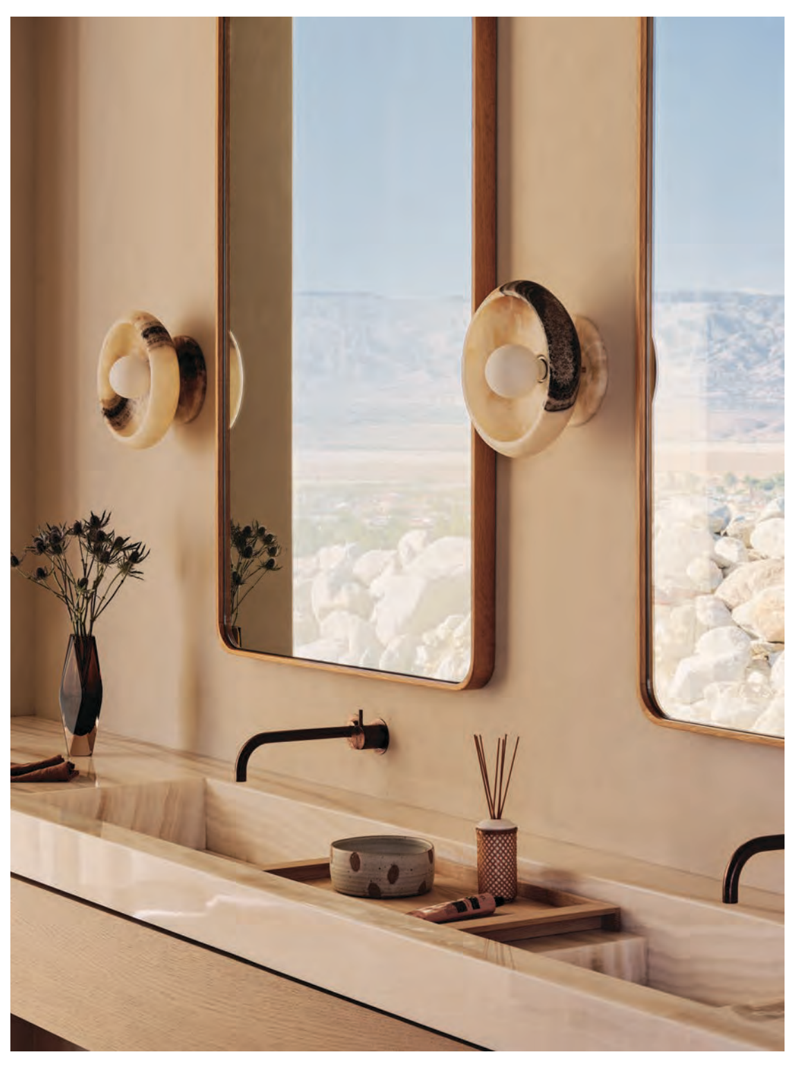
The custom vanity in the primary bathroom is composed of silver travertine and white oak veneer. The bathroom also features Piedra black and white onyx sconces by L'Aviva Home and a Bentwood mirror in white oak by Rejuvenation.