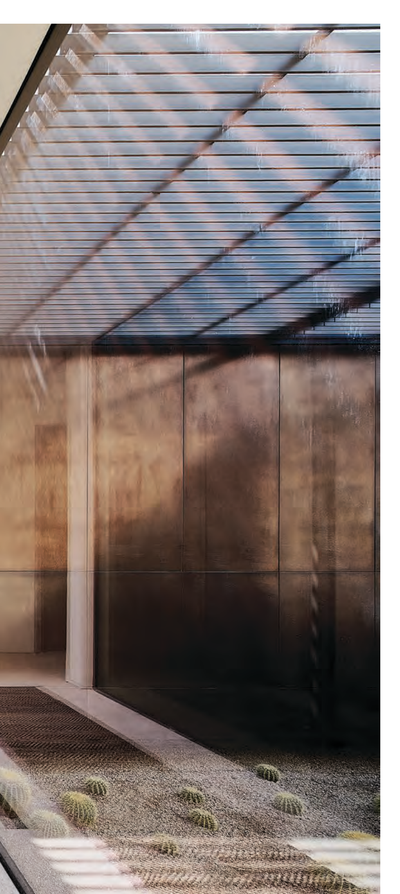
Woods + Dangaran call on desert modernism principles through horizontal lines and the visual and physical relationship between indoors and outdoors. Travertine floors feature throughout the interiors and as part of the outdoor living room. Outside, all added landscape elements were selected to 'blend seamlessly' with the natural surroundings.