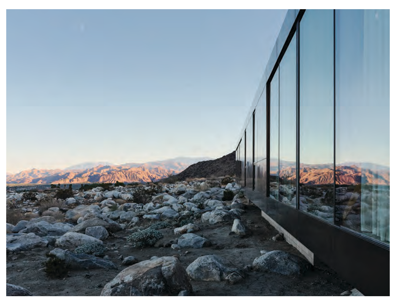
All of Woods + Dangaran's design decisions revolved around the desert environment and context. The exterior is clad with unfinished patinated brass by Argent Fabrication.